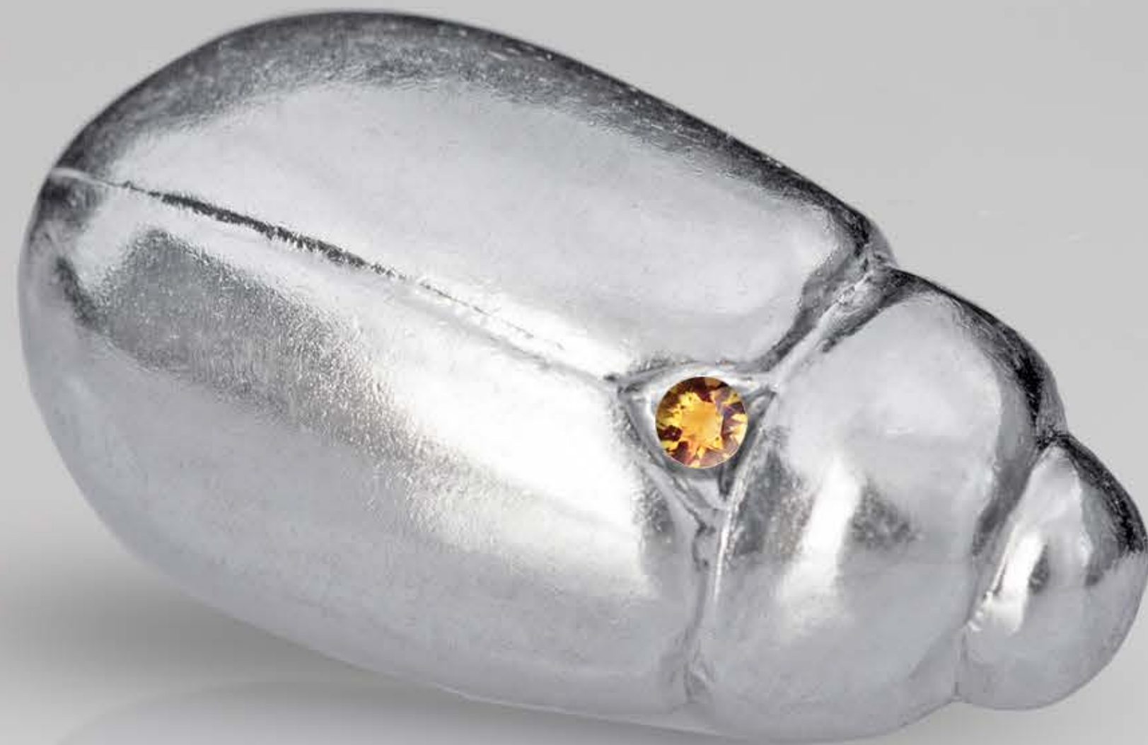
Weevil & Scarab Earrings